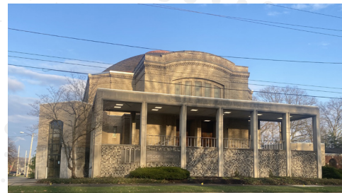
Front-facing side of Temple