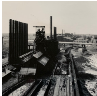
1981 photo of Brier Hill Works' Jeanette Blast Furnace