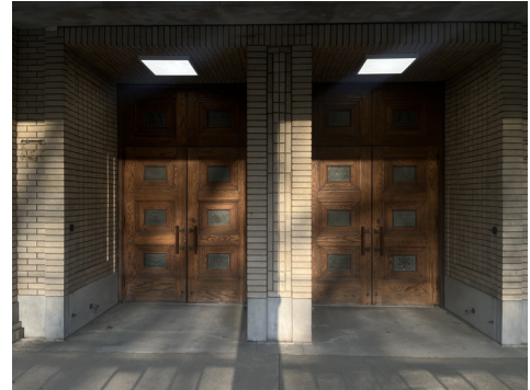
Temple Front Doors