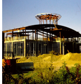
1988 Construction of Musuem

"I've had a fascination with history for as long as I can remember. Halfway through my undergraduate career at YSU, I decided to switch my major from Integrated Social studies to History. I realized my