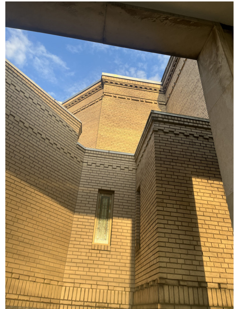
Temple's brick and stone walls