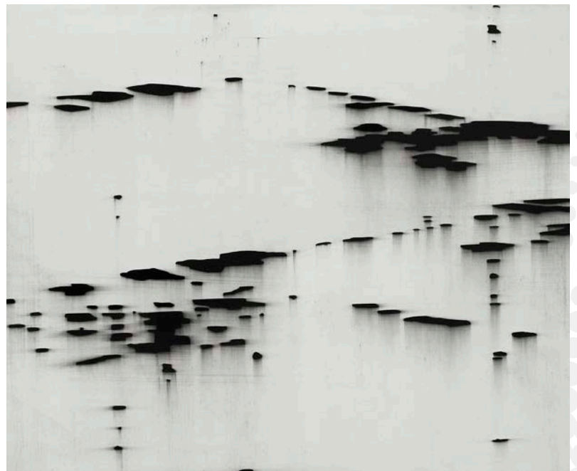
Soft Walk ; charcoal on panel, 20x24 inches, 2021